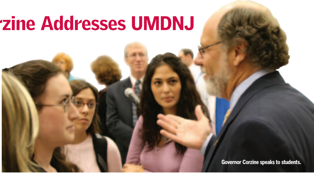
Governor Corzine speaks to students.

More than a thousand people attended in Newark, Piscataway and Stratford; the meetings were connected to other campus locations by interactive video-conferencing. After brief introductory comments, the Governor answered questions posed by audience members on topics that ranged from charity care and the merger proposals to New Jersey's budget constraints and ethics limitations on honoraria.